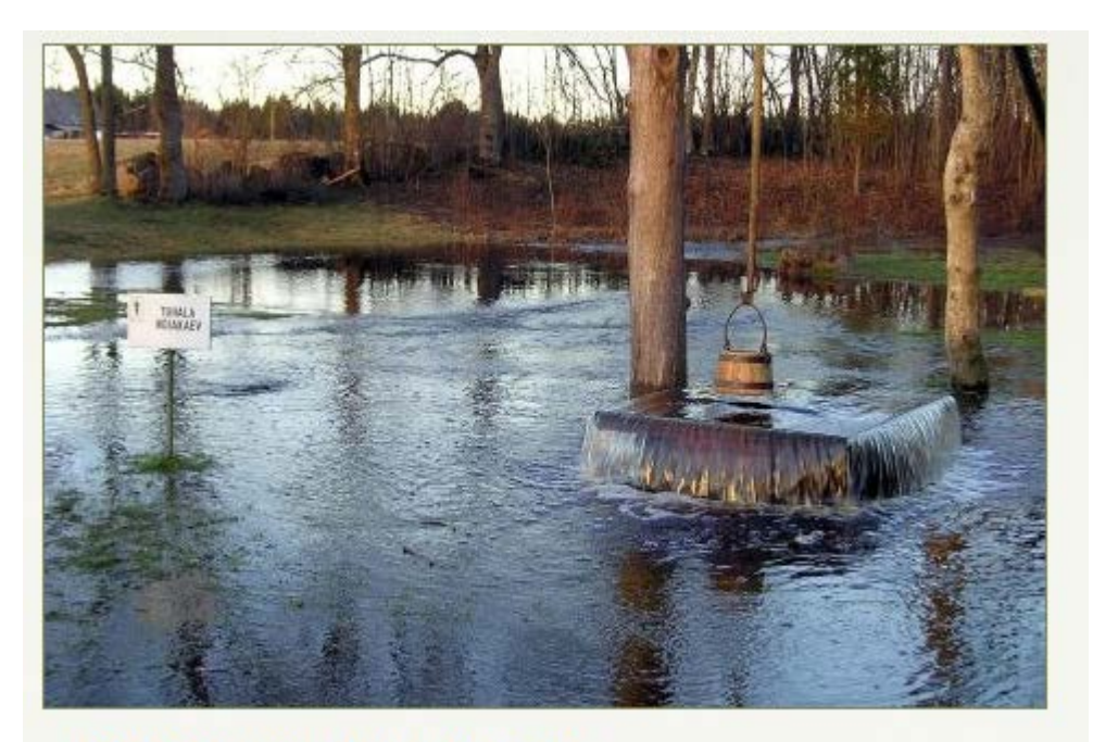
Tuhala nõiakaev keeb.